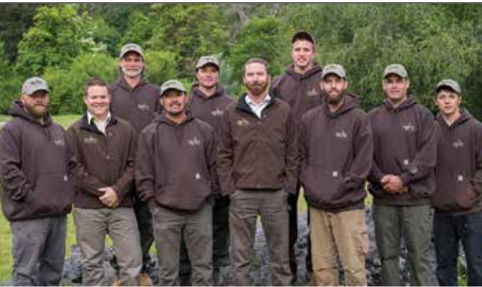
Tree Care Experts

NPHC Inc has been beautifying and caring for residential and commercial landscapes for over 20 years and offers the most comprehensive horticultural and arboricultural knowledge base in the Inland Northwest. We employ more ISA Certified Arborists than any other tree care or landscape company in the region because at NPHC we only deliver professional care.