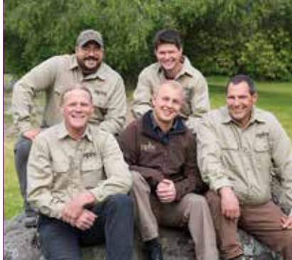
Plant Health Care Specialists

Our goal is to gain your TRUST through expert service and a lasting VALUE . Your referral is our highest compliment.