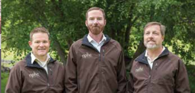
55 Years of Arboricultural Knowledge at your Service!